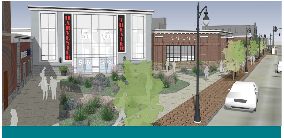
Above, City Centre before improvements; below, rendering of completed City Centre and Harvester 56 Theater