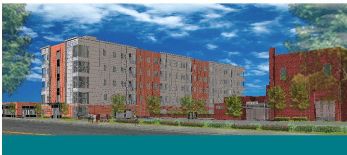
The Ellicott Station Mixed-Use Project , before and after (rendering)