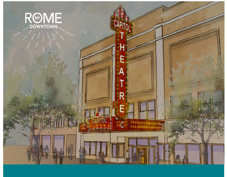
Rome’s Capitol Theatre has once again become an anchor for the arts and downtown vitality.

With $900,000 from the DRI to redevelop Project Blue Crab, Cold Point decided to re-locate to Complex 3 and stay in