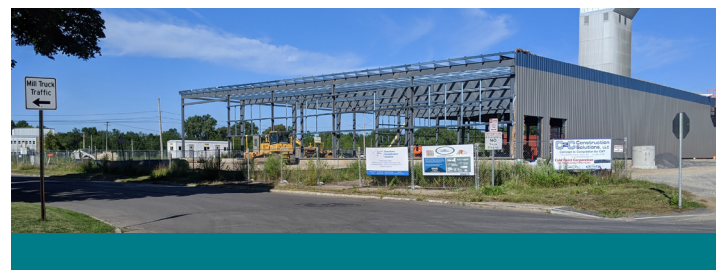
Project Blue Crab under construction