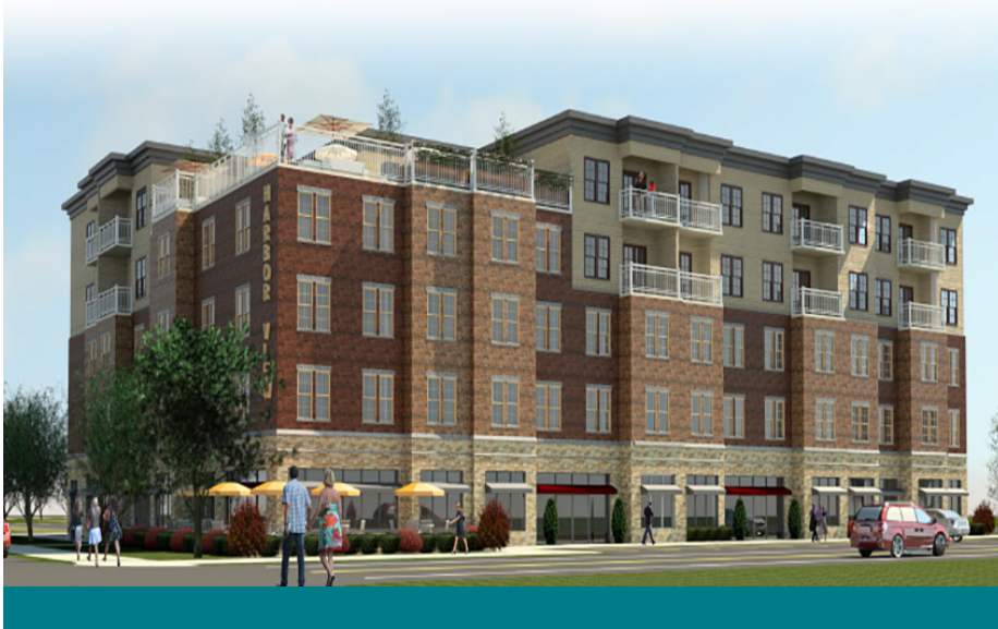
A once-contaminated industrial site (bottom) is now being re-purposed to revitalize the Oswego waterfront with housing, retail and commercial space (below, during construction; top, final rendering) at Harbor View Square