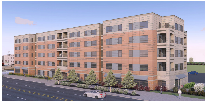
Once a sad reminder of failed Urban Renewal in the 1960s, East lake Commons is revitalizing the East side of the Oswego River (rendering)