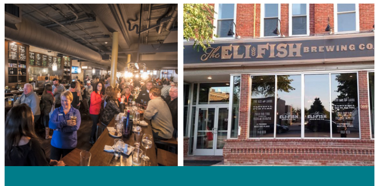
The Newberry Place Lofts mixed-use project. Clockwise from top: Historic Newberry Building; New Eli Fish Brewing Company exterior; Eli Fish Brewing interior