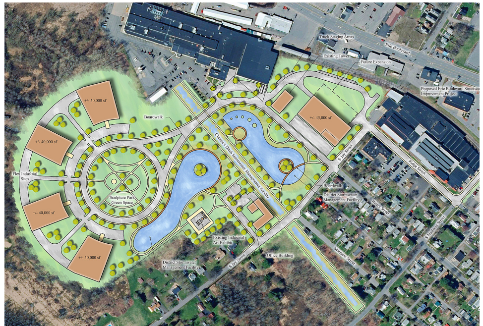
Master Plan for Project Blue Crab/Industrial Park

the city. The DRI effectively reversed the decades-long trend of companies leaving the city—and the State!—by making a downtown brownfield site viable and attractive to an expanding industry. A tremendous reversal of fortune! And a testament to the combined efforts of both the BOA and DRI programs.