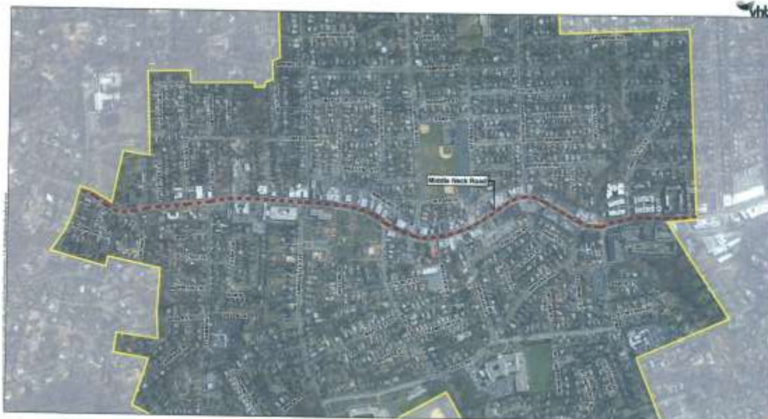
Middle Neck Road and East Shore Road Corridor Study | Village of Great Neck, New York Aerial Map of the Middle Neck Road Corridor

Piccadilly Road north to Steamboat Road. An aerial view of the area including a zoning map is included below.