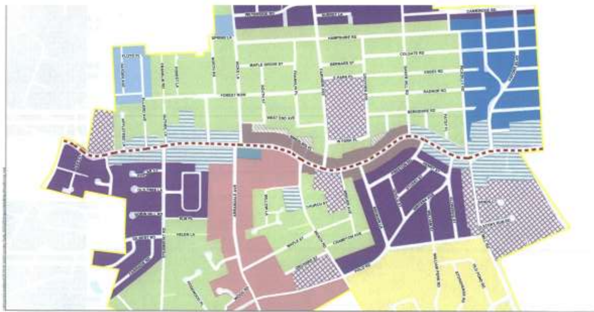
Middle Neck Road and East Shore Road Corridor Study | Village of Great Neck, New York Zoning Map of the Middle Neck Road Corridor