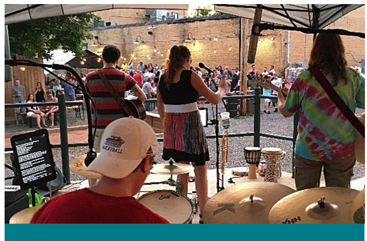
Right: Outdoor Concerts at Four Mile Brewery