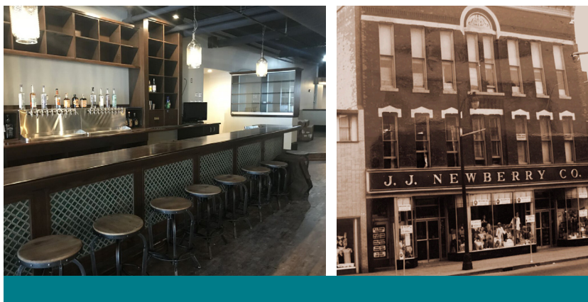
The Eli Fish Brewing Company at the historic Newberry Building