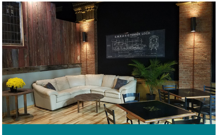
Top: Twisted Rail Tasting Room During Construction