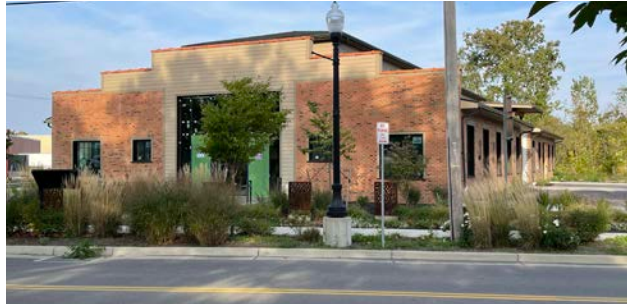
Enterprise Lumber & Silo building at 211 Main Street Top: before the DRI; Bottom: after the DRI

Drawing further on the City's rich history, the DRI invested $1.2 million in the expansion of the historic and iconic Riviera Theatre. Known as the “Home of the Mighty Wurlitzer,” the Riviera Theatre is a major cultural, artistic and economic anchor of the downtown.