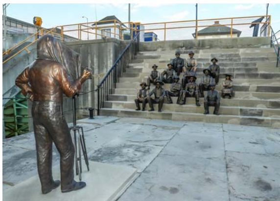
Flight of Five Restoration Lock Tender Tribute Monument

The DRI funded the main interpretive element of the Flight of Five—the Lock Tender Tribute Monument. This collection of statues seeks to enhance the amazing technological feat exemplified by Flight of Five by telling the stories of the people who labored long days, 7 days a week to ‘lock through’ the boats in the late 1800's. Projects like these generate new interest and excitement in the Locks District, resulting in new new investment in the downtown.