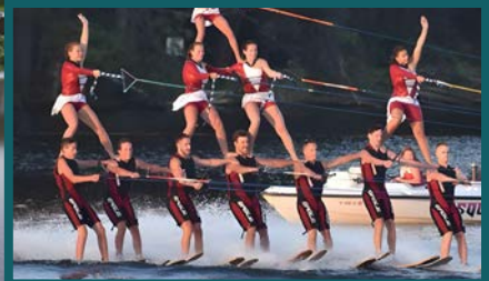
X-Squad Water Ski Show Team