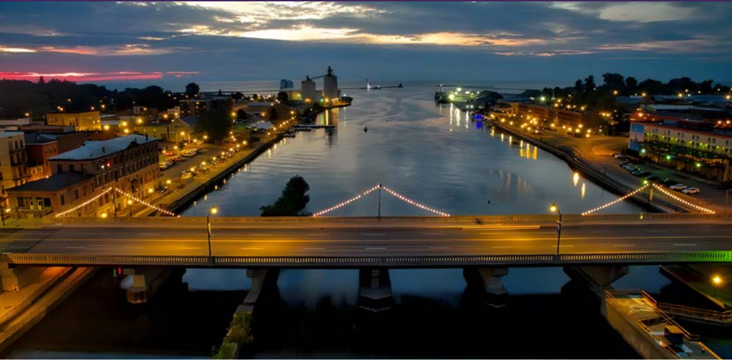
Oswego Canal/River, Lake Ontario, and Oswego skyline.

Heading east on the Canal, we'll take a northward route on the Oswego Canal to visit the City of Oswego. The Oswego Canal is a northern off-shoot of the Erie Canal that empties into Lake Ontario. The city straddles the Canal, with DRI projects on both the east and west shorefronts. So when it comes to downtown revitalization, the city benefits from three waterfronts—both sides of the Oswego Canal/River, as well as Lake Ontario. And the city has taken full advantage of its abundant maritime history with its DRI plan and projects.