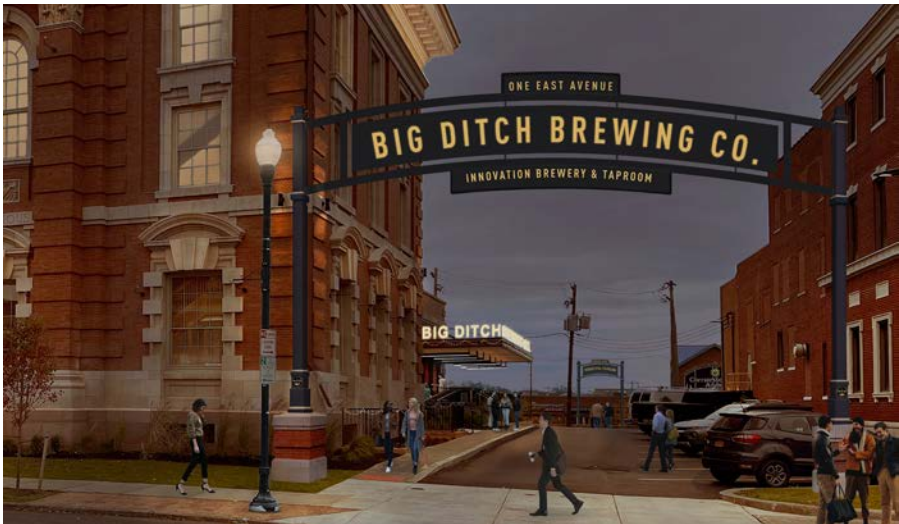
Historic Lockport Post Office