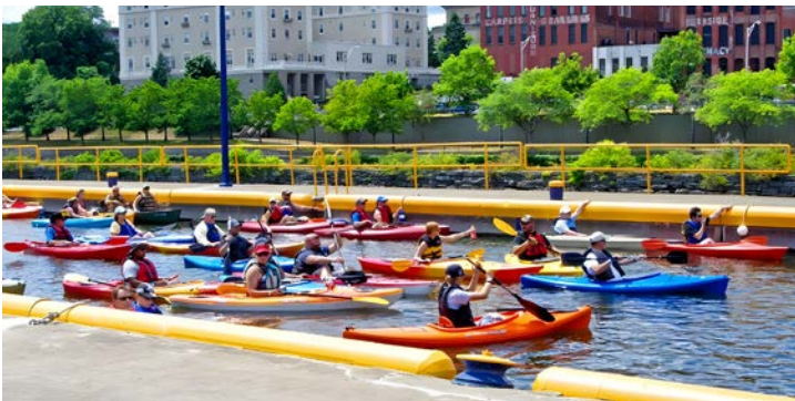
Kayakers on the Oswego Canal/River.