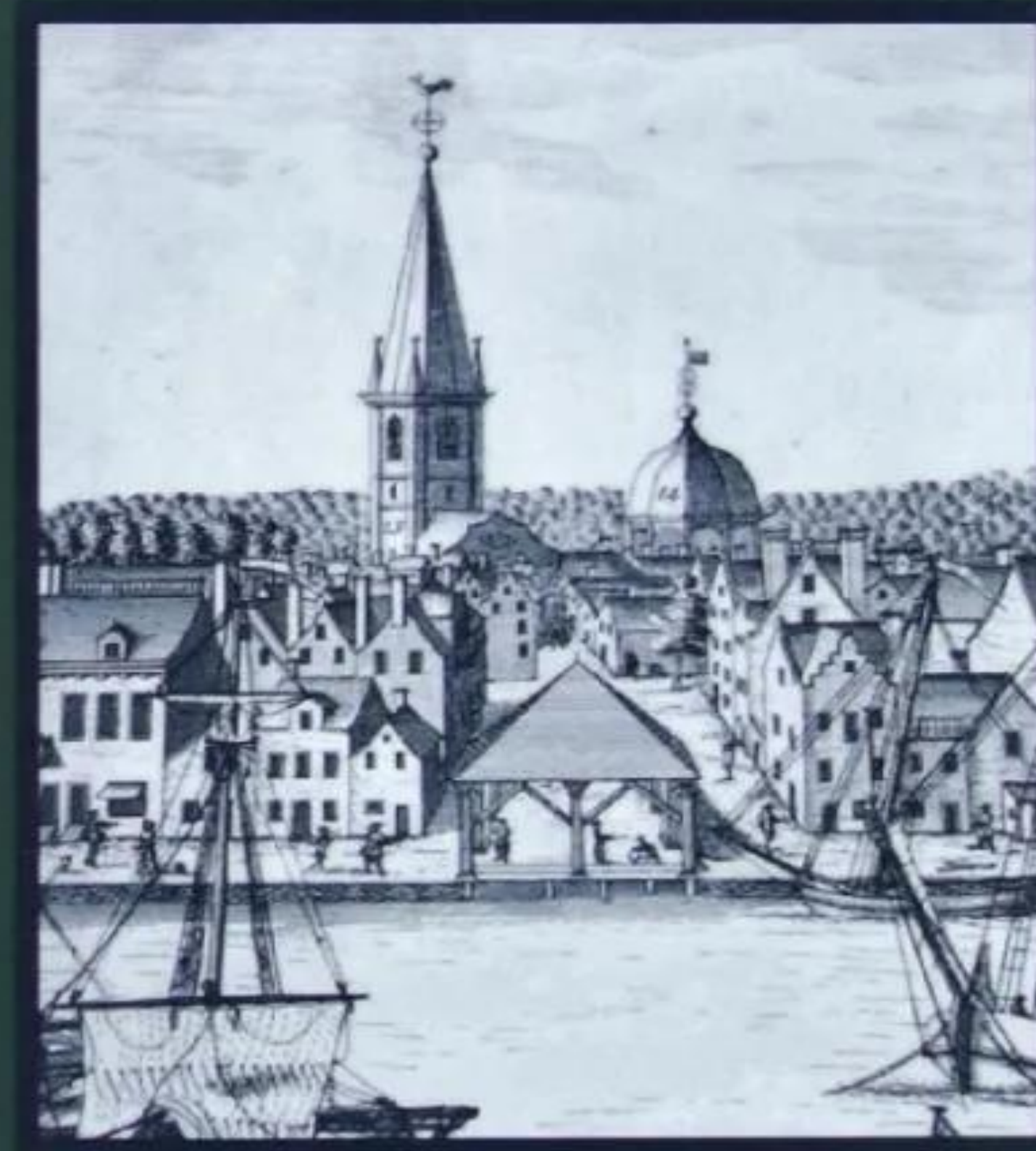
Artist's Rendering, modified detail from The Burgis View, c.1719-21

Slavery was introduced to Manhattan in 1626. By the mid-18th century approximately one in five people living in New York City was enslaved and almost half of Manhattan households included at least one slave. Although New York State abolished slavery in 1827, complete abolition came only in 1841 when the State of New York abolished the right of non-residents to have slaves in the state for up to nine months. However, the use of slave labor elsewhere for the production of raw materials such as sugar and cotton was essential to the economy of New York both before and after the Civil War. Slaves also cleared forest land for the construction of Broadway and were among the workers that built the wall that Wall Street is named for and helped build the first Trinity Church. Within months of the market's construction, New York's first slave uprising occurred a few blocks away on Maiden Lane, led by enslaved people from the Coromantee and Pawpaw peoples of Ghana.